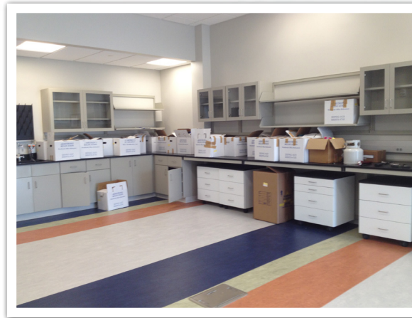
Interior of Auburn's new kinesiology building

The past decade has witnessed a tripling of graduate research assistants and doctoral students, a tripling of external proposals, and a tripling of funded proposals and number of principal investigators. Funds have been found for recruiting a top-flight faculty and launching a distance education program that services more than 2,000 students a year and provides partial financial support for 60-plus graduate assistantships. The department has earned a reputation as a leader in the design and delivery of a diversity program that could serve as a model for universities across the country. Few would question that Auburn