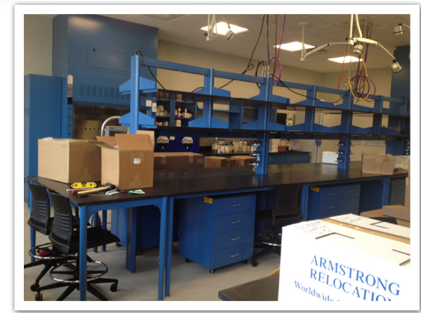
Moving into the new biochemistry lab.

The most recent and visible sign of Auburn's rise to prominence is a new 58,000-square-foot building that serves as a base for 20 faculty members and more than 650 students and offers space tailored to the department's unique assortment of research and outreach endeavors. "This building represents a significant upgrade over our former residence," says department chair Mary Rudisill.