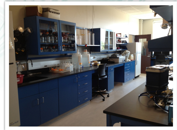
Cardio protection lab.