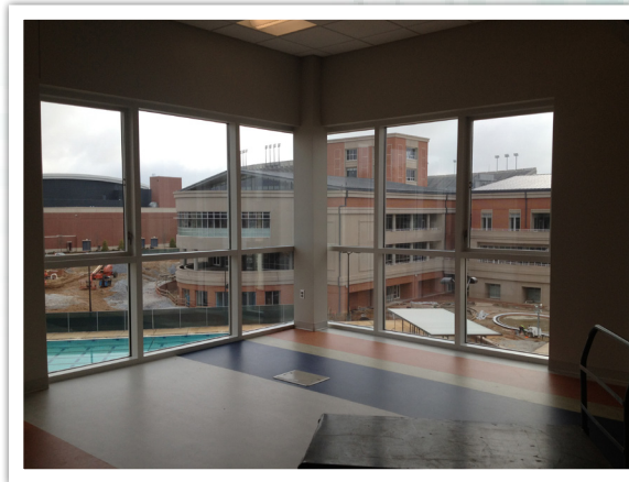
A view from the thermal regulation lab onto the construction site for the new student wellness sustainability building.

The new facility also offers more opportunities for outreach activities with an outdoor play area accessible from a ground-level