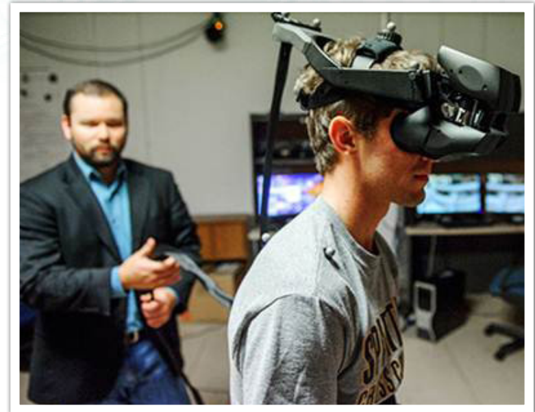
Creating Virtual Worlds in the VEAR Lab at UNCG

The VEAR Lab’s focus on physical rehabilitation makes it unique. Fewer than 10