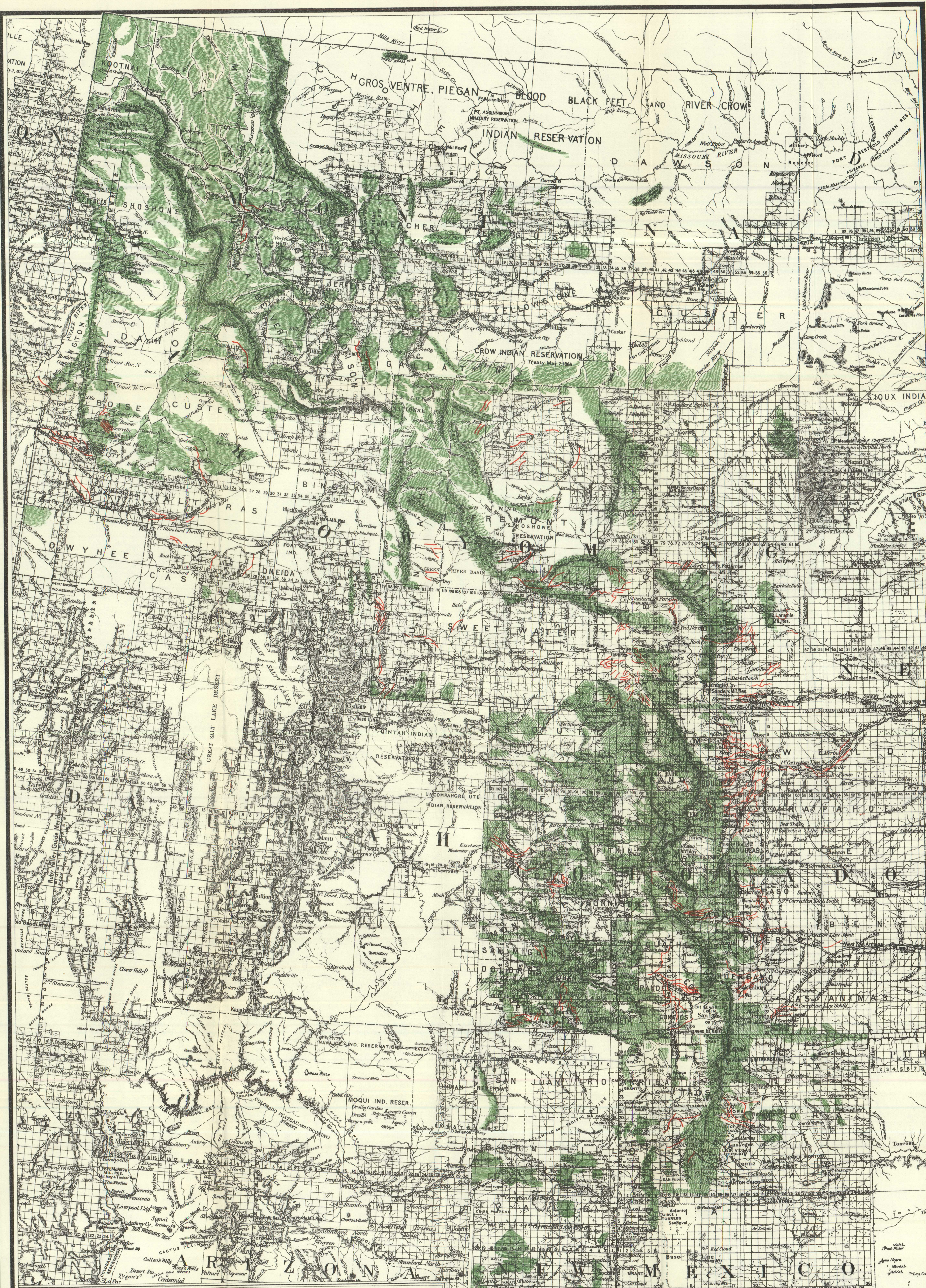
MAP OF THE ROCKY MOUNTAIN REGION SHOWING THE APPROXIMATE LOCATION AND EXTENT OF FOREST AREAS AND IRRIGATION DITCHES IN 1885. COMPILED FROM COUNTY RETURNS BY COL. E. T. ENSIGN, Forestry Agent of the Department of Agriculture. REFERENCES: Forest Lands shown in green, Main Irrigating Canals shown in red lines.