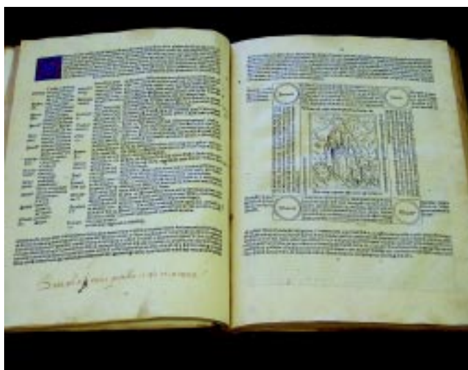
Fasciculus Temporum, written by Werner Rolevinck, was printed in 1480 by Erhard Ratdolt.

Libraries with collections of incunabula, however small, treat these books as special items within their collections.