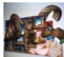
Page 14 Art and education intersect in Honors College course