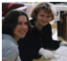
Page 6 Rare incunabula in Special Collections