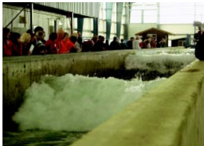
A tour watches the wave tank in action at the O.H. Hinsdale Wave Research Lab. OSU Libraries will work to create a digital library to support the tsunami wave basin research facility.

The library is also working closely with the College of Engineering and the Northwest Alliance for Computational