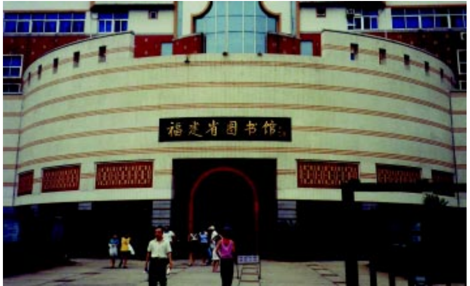
Fujian Provincial Library is a large library that serves the government, people, and businesses of Fujian Province. It contains a diverse collection of resources, many of which are unique materials providing information about the people, history, culture, and economy of Fujian.

Chinese libraries are similar to their American counterparts in terms of goals, organization, technical sophistication, and procedures. However, I noticed some consistent differences. For a variety of reasons, Chinese libraries subdivide and limit access to their collections far more than American libraries. At FPL, the stacks are closed and the only materials that circulate are inexpensive books for which multiple copies are available. There are many service points and sub-collections based on price of item, publication pattern, format, subject, frequency of use, and