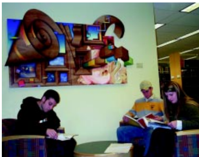
Students study for a geology exam under George Green's Spell of the Magic Play .

The collection can be viewed anytime the Valley Library is open, or on the web at: http://osulibrary.orst.edu/noteworthy_collections/art/