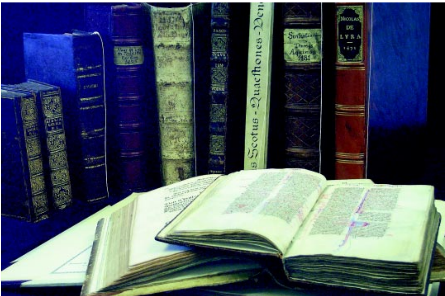
The open book in the foreground and the two standing books on the left are manuscript bibles hand-written in the early thirteenth century. The remaining books here are incunabula spanning the years 1480–1498.

Books printed during this time, prior to 1501, are of interest to students and faculty alike. These examples of early printing contribute to the study of language, art history, and the history of the book and book arts. As with any item of such age (over five hundred years old), preservation is of paramount importance. The books are handled infrequently and with gloves, and are stored in an area where the temperature and humidity is at a set point to prevent mildew, pests, or decay. However, the books are available for scholarly research purposes.