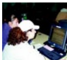
Page 8 Students utilize the Autzen Classroom