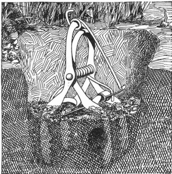
Scissor-jaw, or gripping jaw trap. Phantom view, showing its position in relation to a deeper runway of the mole. Soil must be loosened with trowel and free from obstructions, such as sticks, stones, or clods, in order that the trap may act quickly. The jaws must straddle the course of the runway.