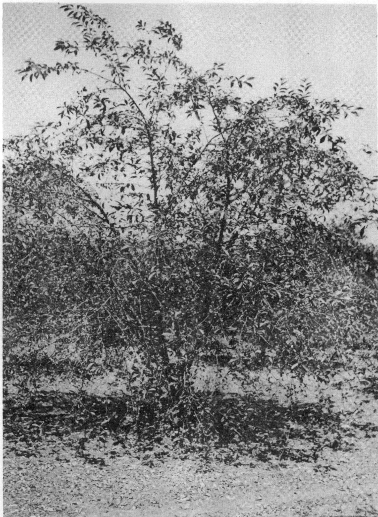
UNSPRAYED CHERRY TREE