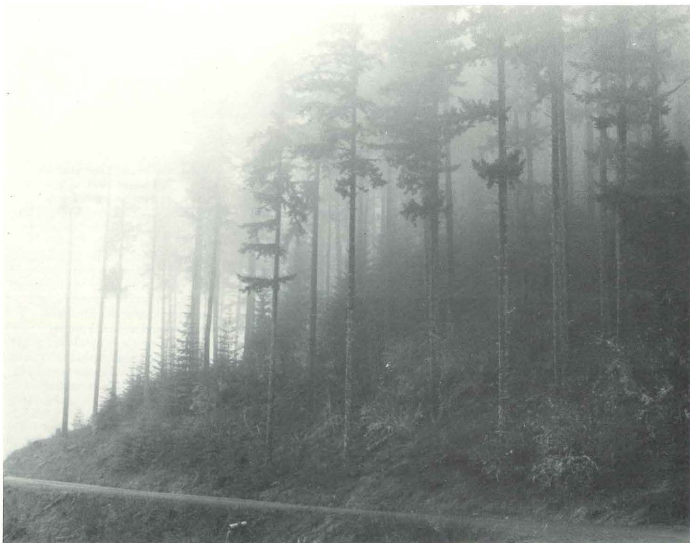
A misty morning on McDonald Forest. The College's extensive research forests came to us thanks to donors' generosity.