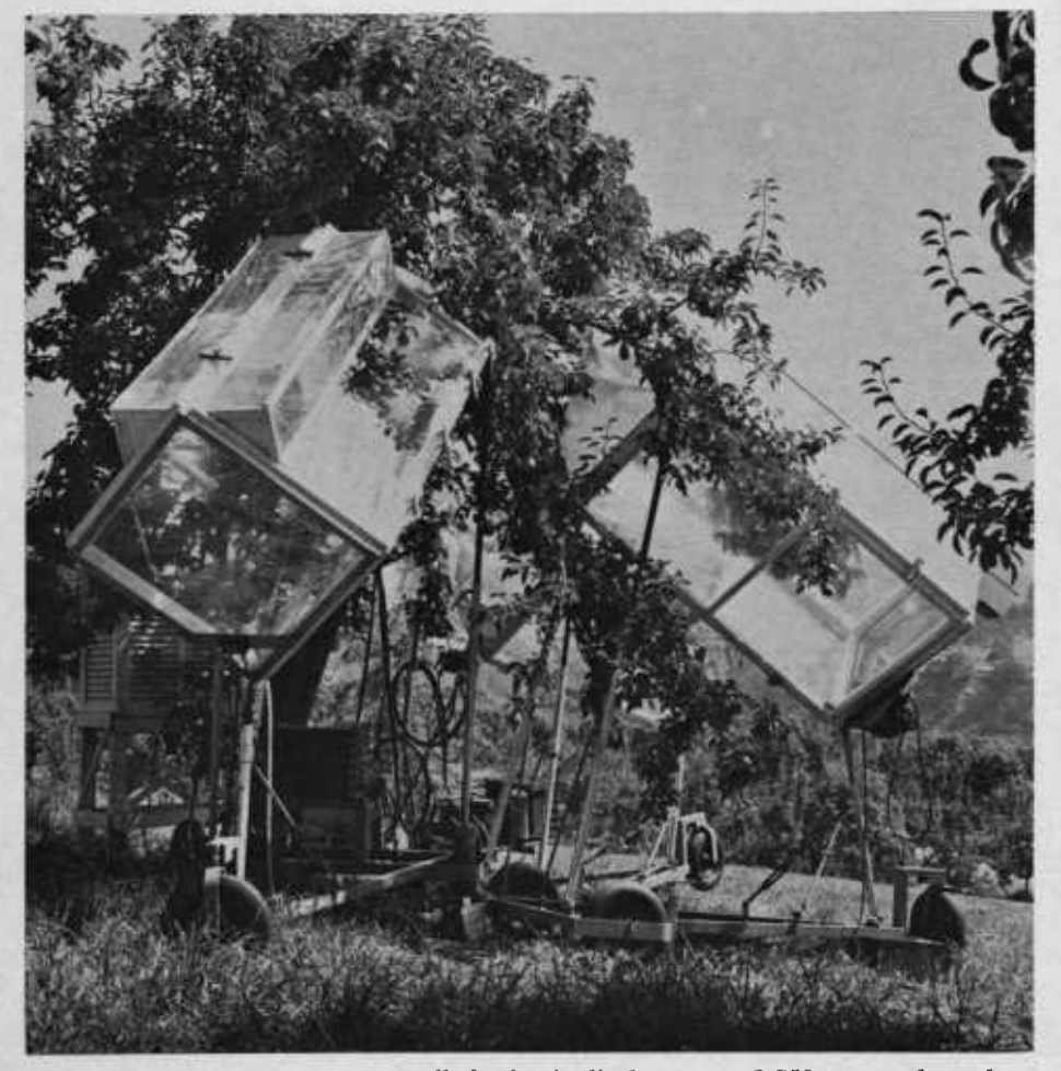
Using these temperature-controlled plastic limb cages, OSU researchers have successfully induced premature ripening condition in growing Bartlett pears.

procedure for isolating chlorinated insecticides from the material slated for analysis. This operation is called "cleanup." After cleanup, a portion of the isolated material is injected into the gas chromatograph. The instrument responds by tracing a graphic pattern similar to that produced by a recording thermometer—of its reactions to the material's chemical makeup.