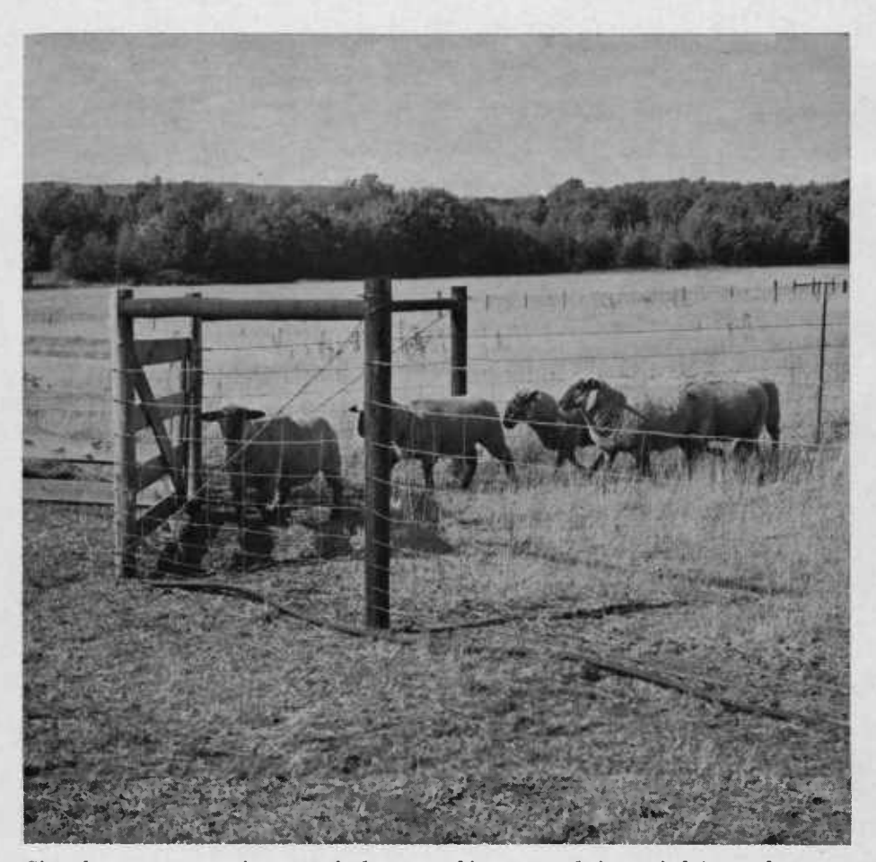
Six sheep per acre is one of three stocking rates being tried in study set up by OSU research team. Objectives of the study are outlined in article below.

The basic animals to be used in the study-20 Suffolk X Hampshire and