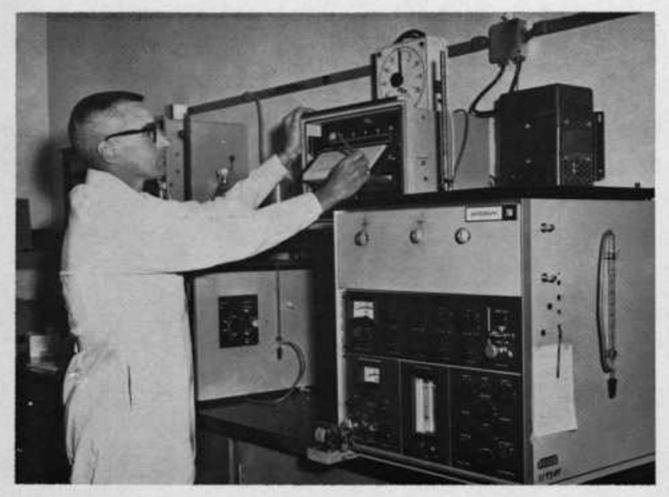
Bills examines the pattern of specially equipped gas chromatograph's reactions to test material previously treated with precise amount of ultraviolet light.