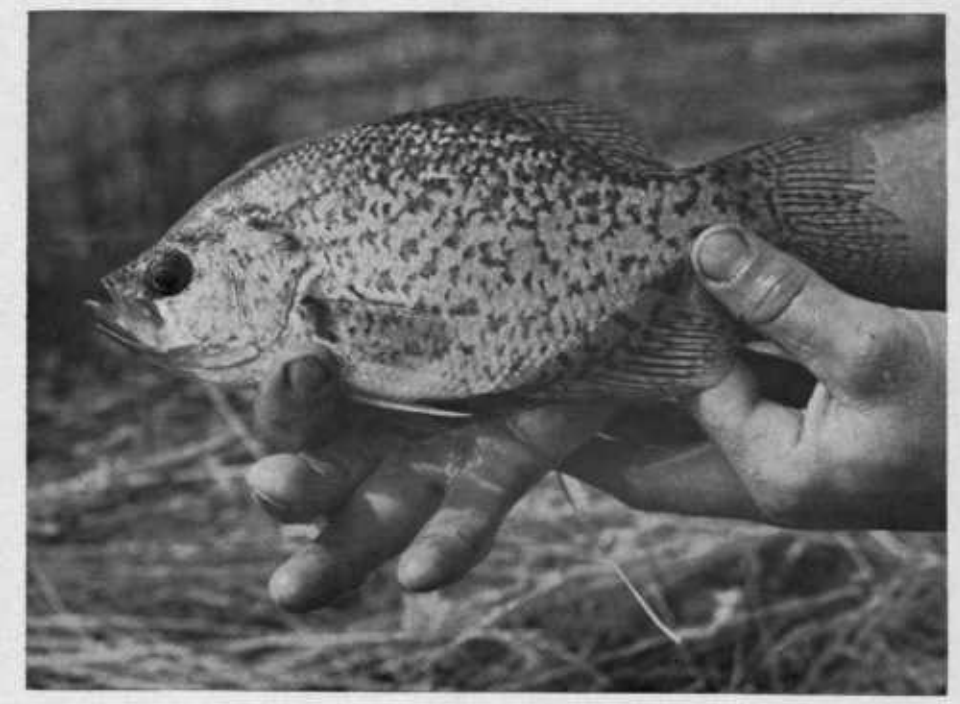
Oregon farm ponds, under normal conditions, can produce black crappies like this fine specimen in three years. Stocking with largemouth bass is suggested.

Overall fishing was best in the spring. The take of both crappies and bluegills then declined steadily from July until November, when the fishing tests were terminated. The bass catch held up fairly well throughout the summer. Crappies and bluegills appeared to favor natural baits—particularly worms,