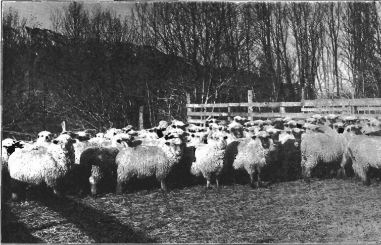
Fig. 2. Lambs that have had peas-and-bald-barley silage in addition to their ration of alfalfa hay and barley.

In the winter of 1918-19 a test was made to determine the value of peas-and-bald-barley silage for fattening lambs. One lot of 86 lambs was fed on one pound whole barley a day and all the alfalfa they would eat, while another lot of 86 lambs was given one pound of peas-and-bald-barley silage per day in addition to one pound of whole barley and all the alfalfa hay they would eat. The results are shown in Table I.