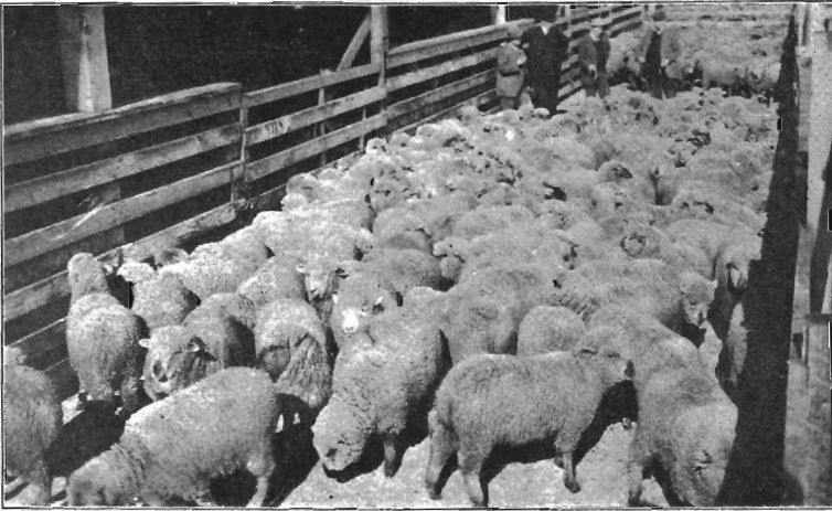
Fig. 4. A car of Experiment Station lambs at the Portland Stock Yards.

These tests indicate that either sunflower silage or peas-and-barley silage make a good addition to barley and alfalfa for fattening lambs and that the advisability of using the silage depends entirely upon its cost as compared with alfalfa and barley. It has been demonstrated not only in these tests but in previous tests described in Station Bulletin 175, that in fattening sheep one pound of barley and all the alfalfa they will eat will produce good gains and a high finish. The addition of silage, therefore, is a matter of economy rather than of additional gains or finish. Where silage can be easily and cheaply grown it will cheapen the ration, but if conditions are unfavorable to growing silage its use will make the ration more expensive.