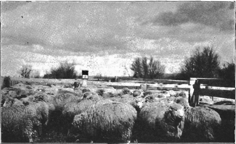
Fig. 1. Lambs after being fed 71 days on barley, alfalfa hay, and sunflower silage.