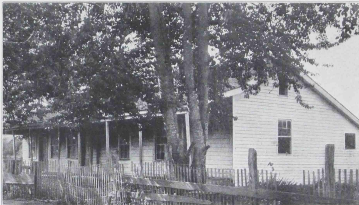
GOFF HOUSE NEAR RICKREALL, POLK COUNTY Photographed about 1895