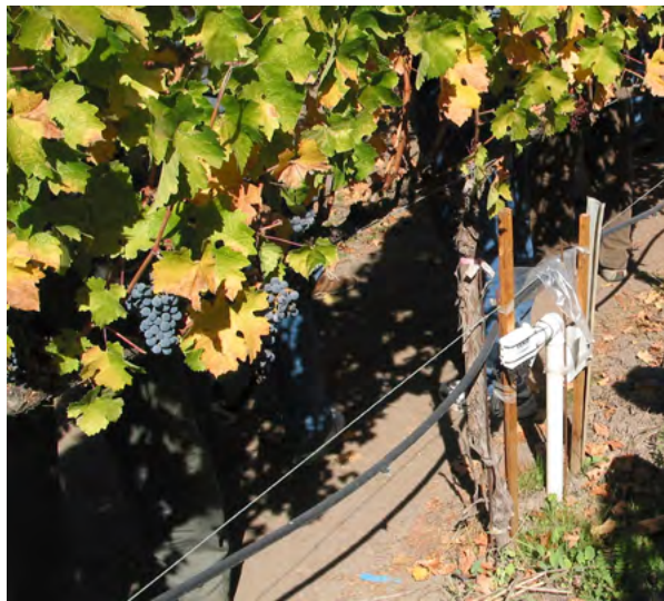
Drip irrigation tubing used to irrigate wine grapes.

Drip irrigation provides slow, even application of low-pressure water to soil and plants using plastic tubing placed in or near the plants' root zone. It is an alternative to sprinkler or furrow methods of irrigating crops. Drip irrigation can be used for crops with high or low water demands.