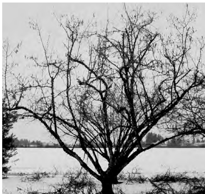
Figure 1. Mature tree after a rotational pruning.

Trim out the center branches, and shorten the low laterals. This makes it easier to move equipment in the orchard. Remove suckers that grow up through the canopy from lower limbs, unless you can use these suckers to fill an opening in the top of the tree. In general, thin the tree so that sunlight penetrates to all parts of the tree.