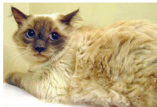
Rescued Siamese cat Mallory was the 10,000th animal altered at OHS.

For the full story, including a video: http://www.oregonhumane.org/news/stories/10000thSpayNeuter.asp