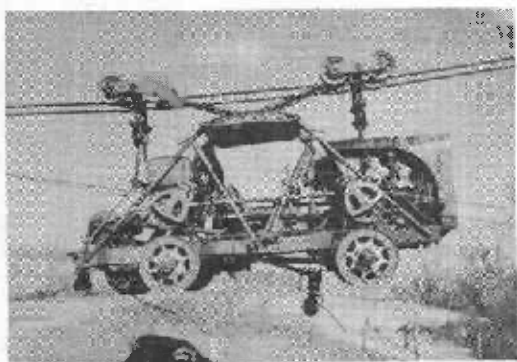
Figure 2.--Skyhook carriage.