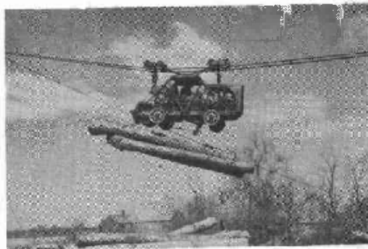
Figure 3.--Skyhook transporting a load of logs.