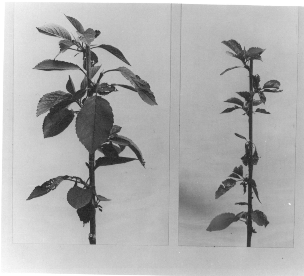
Figure 4. Greenhouse grown Montmorency illustrating two of the more severe disease classes established for degree of cross protection. Tree on the left is class 3 and shows many leaves with necrotic spotting; tree on the right is class 4 with most leaves showing necrotic spotting and an occasional tip blight.