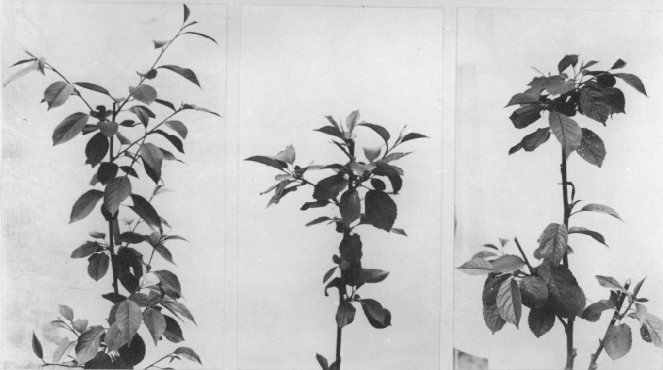
Figure 3. Greenhouse grown Montmorency illustrating three of the milder disease classes established for degree of cross protection. Tree on left is class 0 and illustrates normal tree or no reaction; center tree is class 1 with a mild reaction of chlorotic mottling; trees on right show a more severe reaction with some necrotic spotting.