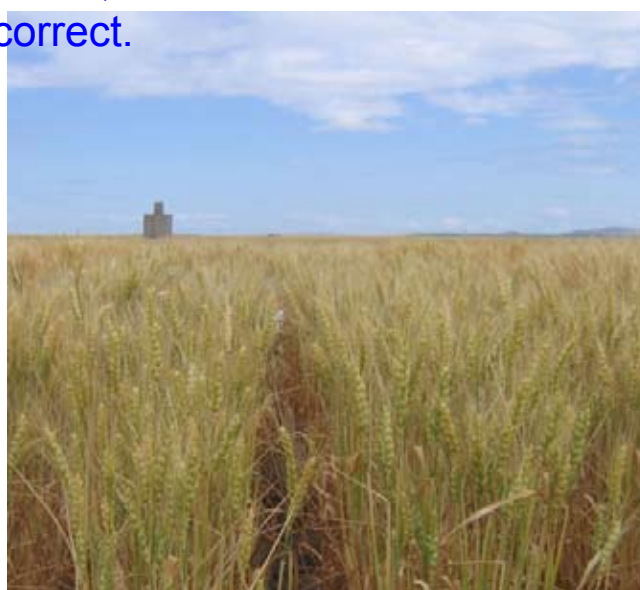
Figure 4: Norwest 553 ripening in the field near Lexington, Oregon.

Norwest 553 has been shown to have high yield potential across a range of environments in Oregon and Washington. It excels in the high rainfall and irrigated production systems in both states. In more than 6 site-years of OSU variety testing in high rainfall and irrigated environments, Norwest 553 averaged 114.7 bushels per acre, similar to Agripro Paladin and Stephens and 18 bushels per acre higher than Bauermeister (Table 1). Similarly, in 10 site-years of WSU variety testing in high rainfall and irrigated environment, Norwest 553 averaged 131.2 bushels per acre, similar to Boundary and 5 to 10 bushels higher than Eddy, Agripro Paladin, and Bauermeister (Table 2).