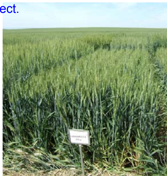
Figure 3: Norwest 553 in the field.

Norwest 553 was released in 2007. It was co-developed and is co-owned by Oregon State University and Nickerson U.K. It is protected under Plant Variety Protection act with the Title 5 option. Seed of Norwest 553 is available only as Certified seed through licensed seed dealers. Commercial growers may not retain or sell seed for planting or replanting.