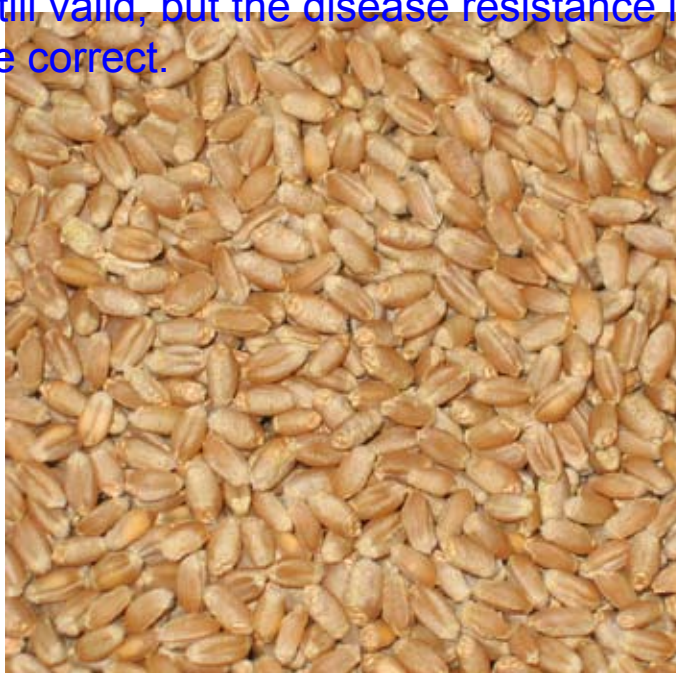
Figure 5: Red seed of Norwest 553 harvested near Lexington, Oregon.

Grain protein of Norwest 553 averaged 11.5% in Oregon and 12.6% in Washington similar to Agripro Paladin. Norwest 553 averaged 0.5 to 0.7% higher grain protein than Bauermeister and Boundary in Oregon and Washington (Tables 1 and 2).