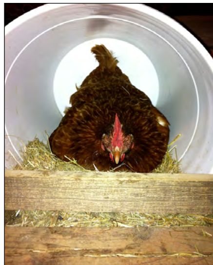
Figure 3. A 5-gallon bucket is a creative alternative to the traditional wooden nesting box.

For more information, please see the OSU Extension Service Catalog at: http://extension.oregonstate.edu/catalog/