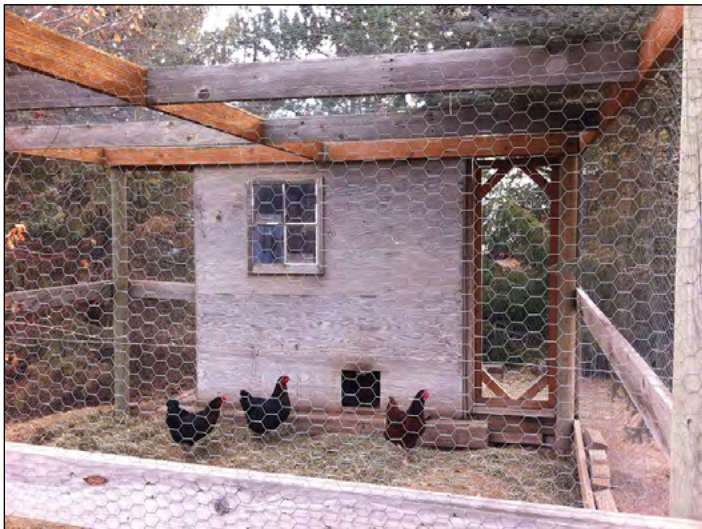
Figure 1. Chicken coop with outdoor enclosed run