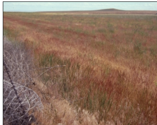
Figure 2.—Jointed goatgrass growing in a Conservation Reserve Program field along a fence near Nye, Oregon.