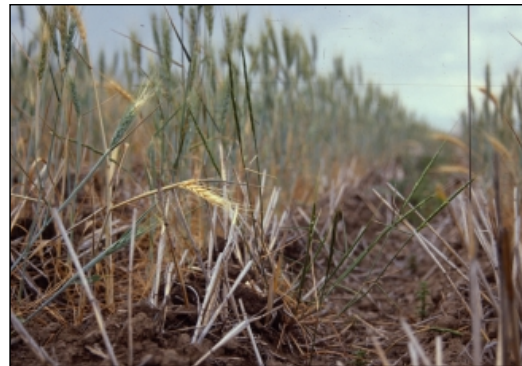
Figure 1. —A mature jointed goatgrass plant can be spotted easily growing between wheat rows.

As the plant matures, jointed goatgrass follows a life cycle very similar to that of winter wheat. Specific growth stages are distinguished by changes in