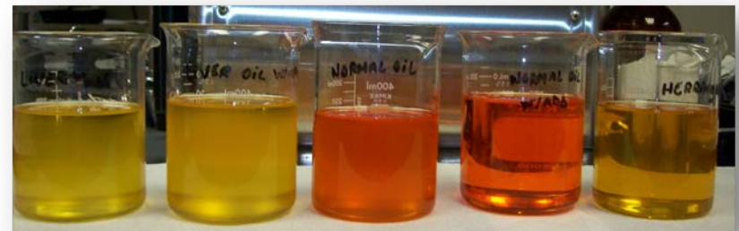
Edible fish oils