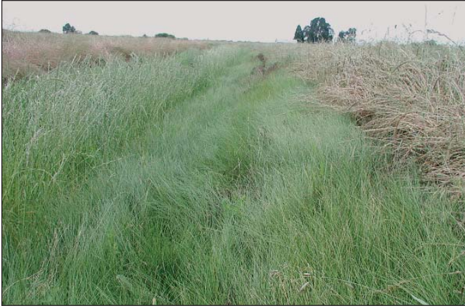
Figure 3. Creeping red fescue filter strip 10 months after planting in the Willamette Valley, Oregon.