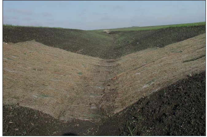
Figure 4. Firm, smooth seedbed prepared for vegetative filter strip planting. Erosion control fabric used near field tile drains.

land served by the filter strip (Figure 4). Proper seedbed preparation is critical, given that the filter strip will be a long-term planting. Test soil pH and fertility, and add appropriate soil amendments for the chosen filter strip species prior to final seedbed preparation and planting.