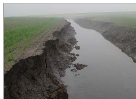
Figure 2. Current ditch and streambank management practices often result in weedy vegetation that contaminates nearby crops (left) or bare ground that is prone to soil erosion and allows field runoff water to drain unfiltered into water sources (right).