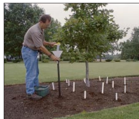
Figure 4.—Filling holes with fertilizer.