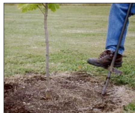
Figure 3.—Using a punch bar to dig holes.