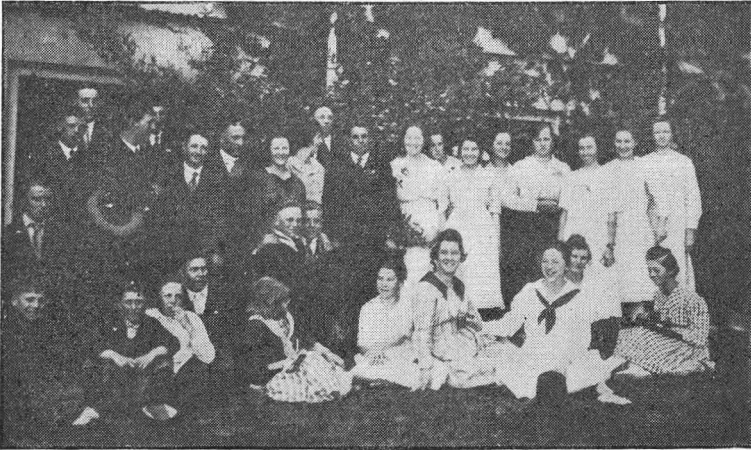
STATE CHAMPIONS AT O. A. C. SUMMER SCHOOL, 1919

4. The premiums include those regularly offered by the State Board of Fair Directors; the trip to the Oregon Agricultural College Summer School, offered by business men of Portland through the efforts of the State Superintendent of Public Instruction; and those offered by different county