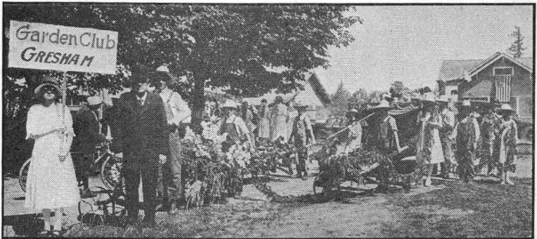
GARDEN CLUB IN FOURTH OF JULY PARADE, GRESHAM, OREGON

Exhibit. A vegetable exhibit, consisting of five and no more different varieties, is required in all local, county, and State Club contests. One head of cabbage, cauliflower, lettuce, spinach, kale, etc.; one melon, pumpkin, squash, cucum-