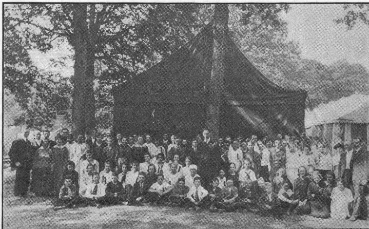
COUNTY CLUB CHAMPIONS AT CLUB CAMP, STATE FAIR GROUNDS, 1919

Boys' and Girls' Club work is a permanent educational organization conducted by the Extension Service of the Oregon Agricultural College and the United States Department of Agriculture, cooperating with the State Department of