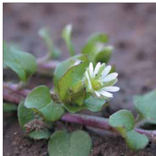
Figure 18. A weed shift to common chickweed was caused by repeated use of oxadiazon.

ACCase-inhibiting herbicides are valuable for their ability to selectively and safely remove grasses from nursery crops. They are so easy to use that many growers rely too much on these products for grass control. Development of resistance to these products in grass weeds would cause serious problems for nursery producers. Change management practices in order to prevent grass populations, thus limiting the need for selective postemergence grass herbicides.