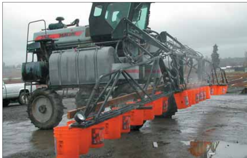
Figure 10. Buckets hang from this boom sprayer to verify that output is uniform between nozzles.

Preemergence herbicides sprayed on the soil surface initially create a very thin and highly concentrated layer on the soil surface. These herbicides should be incorporated