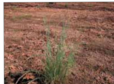
Figure 4e. Wild garlic.