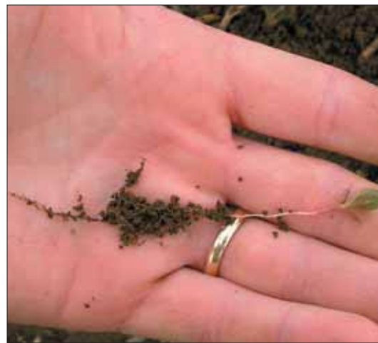
Figure 8. Even small weeds can have deep root systems already growing below the chemical barrier, making preemergence herbicides ineffective.