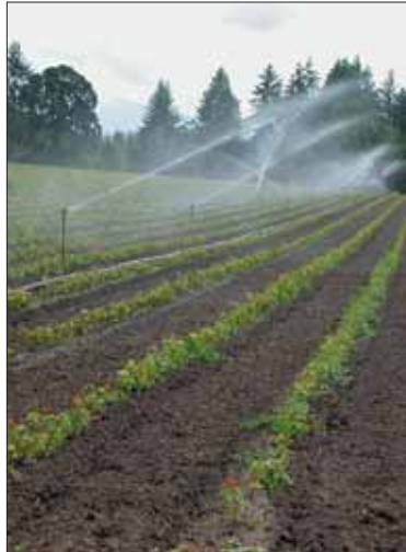
Figure 5. Overhead irrigation increases weed growth compared to drip irrigation.

Many field nurseries place drip tape several inches beneath the soil surface prior to planting. Crops can be fertilized through the drip tape. This method of fertilization is efficient and inexpensive, and it requires less labor compared to applying dry fertilizer to the soil surface with mechanical equipment. Also, nutrients can