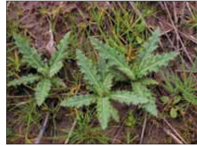
Figure 4a. Canada thistle.

Drip irrigation is preferable to overhead irrigation (Figure 5, page 4). Drip irrigation provides water directly to nursery crop roots. The areas between rows remain dry and less conducive to weed seed germination compared to