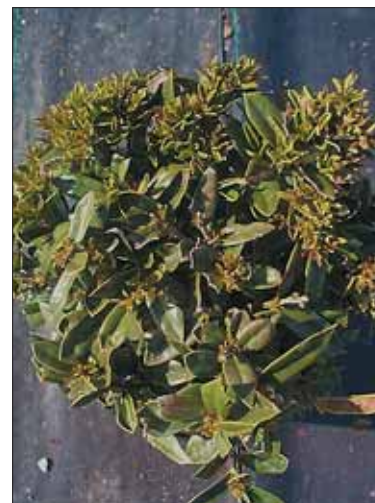
Figure 15. A sublethal dose of Roundup causes stunting and foliar rosetting on holly.

In the case of a translocated herbicide, minor contact with the nursery crop could cause severe injury, although it may not be immediately noticeable. Small amounts of translocated herbicide can be moved throughout the plant and accumulate in root and shoot tips. This type of sublethal dose might not kill the