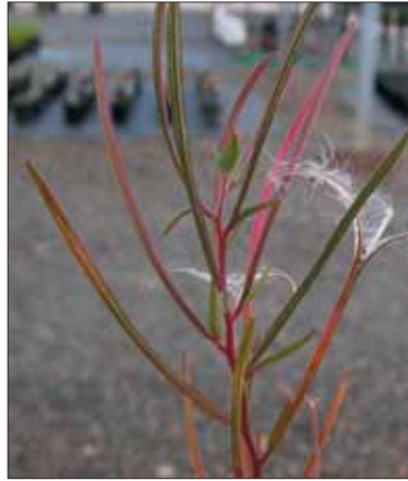
Figure 3.—Seeds of northern willowherb (family Onagraceae) and many other weeds in the family Asteraceae are wind dispersed.

Identify weeds in areas soon to be cultivated and note whether any have the potential for spreading by severed root pieces and/or propagules. If these species are present, flag the area so machinery operators do not distribute the plant. Kill the weed by spot spraying (Table 2, page 12), then leave that area of the field flagged for