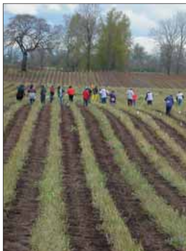
Figure 14. Hoeing is an expensive component of weed control and should be minimized.

Translocated herbicides are absorbed by the foliage,