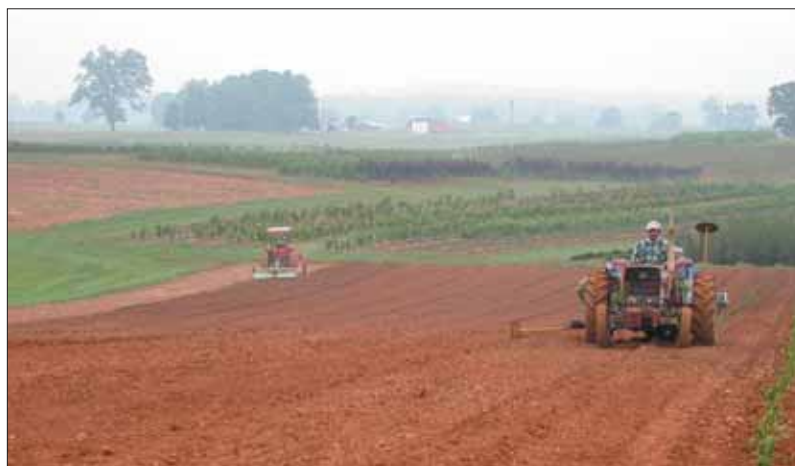
Figure 1. The tractor on the left is tilling the field to prepare for planting, while the tractor and crew on the right are planting trees. This method provides a weed-free soil immediately after planting for preemergence herbicide applications.

Whether plowing, disking, or rototilling, till only as much as necessary to adequately prepare the soil for planting. Excessive tillage damages soil health. It can accelerate organic matter breakdown, reduce soil aggregates, increase the potential for soil compaction, reduce