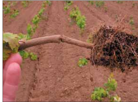
Figure 13. Girdling of red maple liners caused by improper use of prodiamine. Prodiamine is not labeled for use on this species.

Herbicides that are effective at controlling emerging grasses and some small-seeded broadleaf weeds (but not all