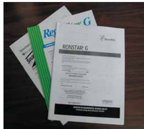
Figure 12. Select herbicides based on crop tolerance and weed susceptibility.

A third problem is rapid germination of weed seed prior to herbicide incorporation. Weed seed germinates within several days after soil is prepared for planting the crop. As mentioned above, some herbicides allow up to 3 weeks for incorporation. However, prior to incorporation, herbicides create a very thin and highly concentrated layer on the soil surface. Some weed seed may germinate under and grow through the thin chemical barrier, suffering little adverse effect.