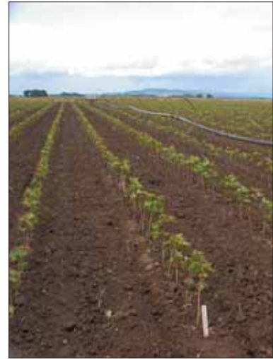
Figure 2. Irrigation, fertilization, and wide spacing in newly planted fields provide an ideal environment for weed growth.

Maintain drainage ditches with vigorous turf and mow them regularly. Hard fescues are low-maintenance turfs that grow slowly when not irrigated. They form a dense turf that inhibits weed growth.