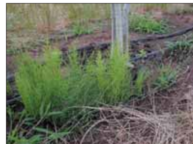
Figure 4d. Horsetail.