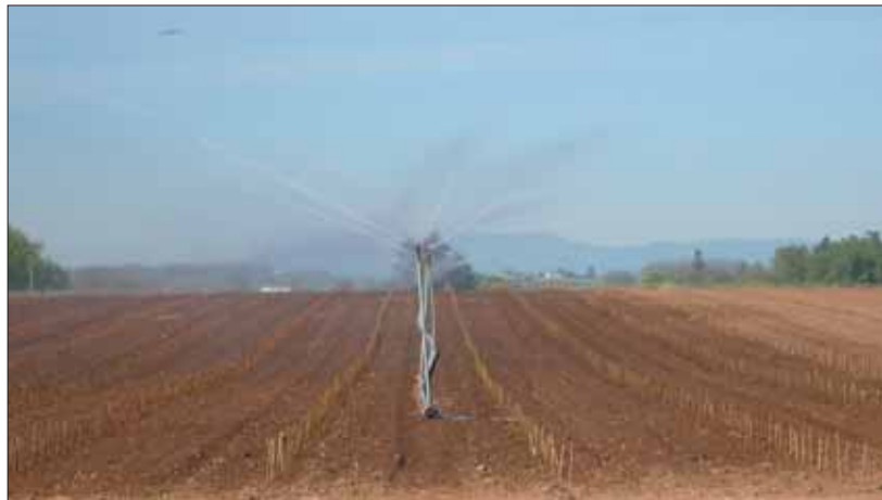
Figure 11. Overhead irrigation is the most reliable method for incorporating herbicides.

Repeated cycles of small rain events followed by