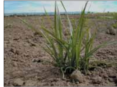
Figure 4b. Yellow nutsedge.