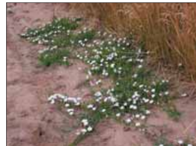
Figure 4c. Field bindweed.