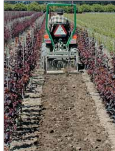
Figure 6. Cultivation between rows has many short-term benefits, but can have long-term negative consequences.

Cultivation results in less herbicide use. For nurseries using overhead irrigation, repeated cultivation keeps the soil surface from crusting,