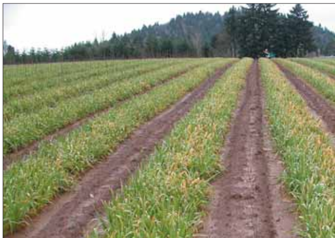
Figure 7. Living mulches between nursery rows provide weed control and have numerous beneficial impacts on soil properties.

Existing weeds must be removed or killed prior to application of preemergence