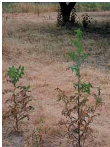
Figure 16. Poor coverage with a contact herbicide allowed this weed to continue growing.

Thorough coverage of plant foliage is important for postemergence herbicides.