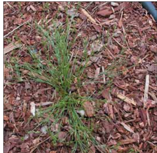
Figure 17. Toad rush ( Juncus bufonius ) looks like a grass; however, it is not in the grass family and is not controlled by grass-selective herbicides.

Goal contains the active ingredient oxyfluorfen. It is commonly used as a preemergence herbicide, although it also can be used as a nonselective contact herbicide for small weeds (less than 4 inches tall). Goal is commonly used in conifer production, where it can be safely applied over the top of many dormant conifers. Use caution around deciduous plants; directed sprays are necessary.