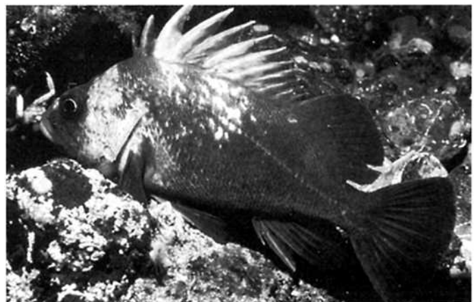
The quillback rockfish ( S. maliger ) is under status review for listing under the Endangered Species Act.