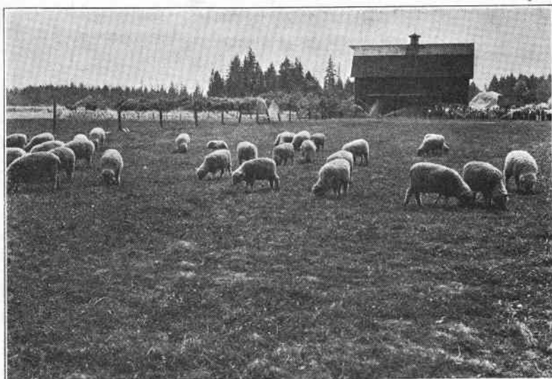
Figure 1. Sheep on sprinkler irrigated Ladino clover pasture.

When seeded for pasture purposes Ladino frequently is combined with grasses that fit in well as companion plants and make satisfactory growth under similar conditions. Commonly used mixtures based on experimental plantings are as follows: