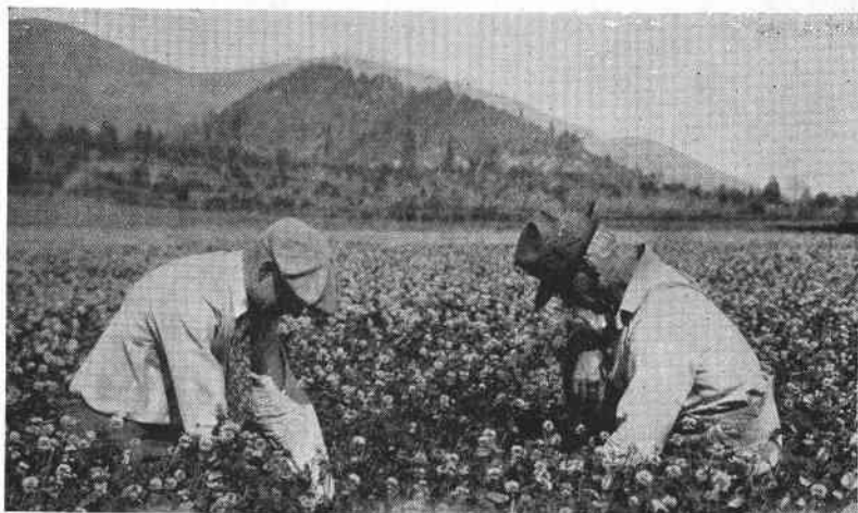
Figure 2. A good stand of Ladino clover.

the soil, the stand, and the growing conditions under which the crop is produced. If a full stand is maintained more seed is produced as the plants advance in age.