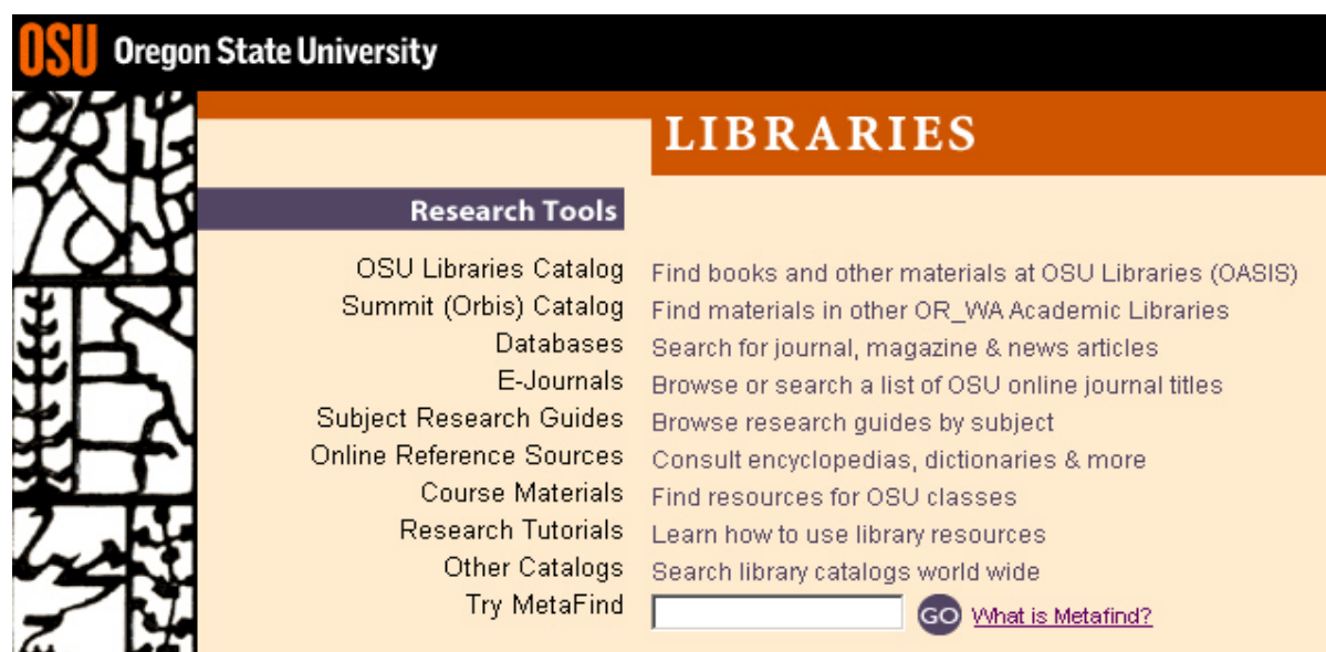
FIGURE 3: OSU LIBRARIES' HOMEPAGE

3. The quick search box searches heavily-used, multidisciplinary, full-text databases and the Libraries' catalog. This combination gives users a quick and easy search experience which results in a high number of full-text records. Next to the search box is a link to a help page – “What Is MetaFind?” - which briefly explains MetaFind, describes what it searches and provides a link to the advanced search page.