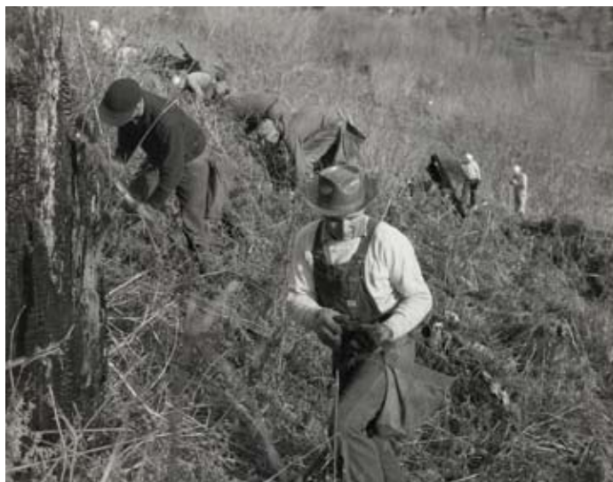
Figure 2.—Replanting the Tillamook Burn illustrated the importance of using local seed sources. Trees from more distant sources did not do as well as trees from nearer seed sources.

It would be nice if there were a consistent distance, some magic number (say, within a 50-mile radius), to indicate how far a plant might be moved successfully, but it is not that simple. For plants, “local” is best defined ecologically, in terms of climate and environment, rather than in miles. For example, the environments of Coos Bay and Astoria (200 miles apart) are much more similar than the environments of Coos Bay and Roseburg (just 50 miles apart). The conditions to which a plant species must adapt (and what make Coos Bay