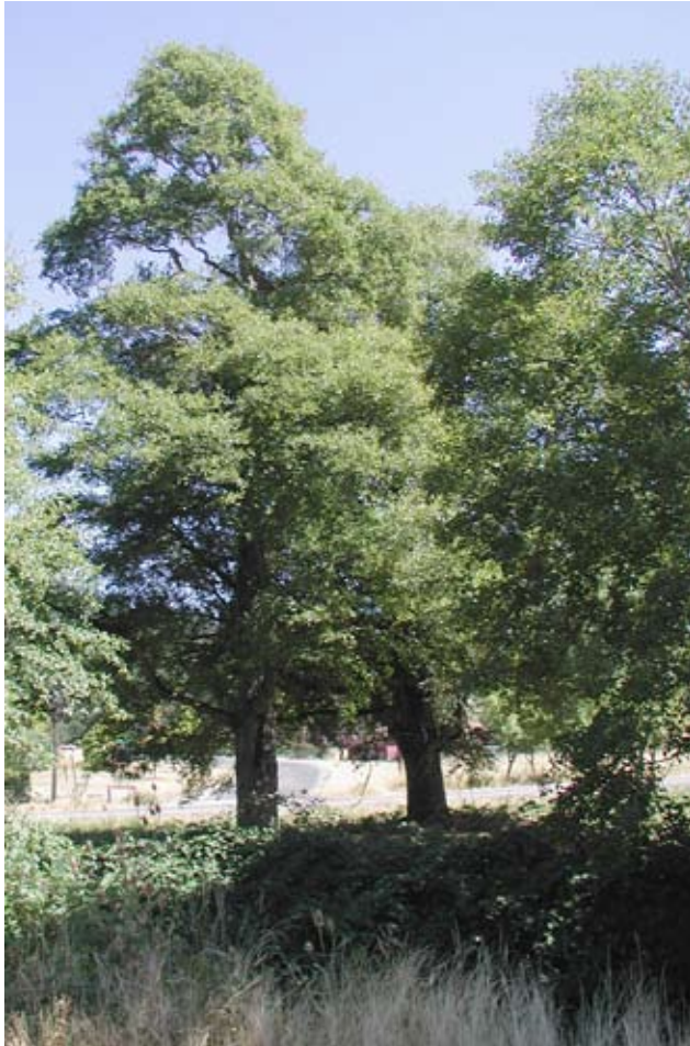
Figure 7.—White alder (above and inset at right) is a widespread species that is well adapted to riparian conditions in the Willamette Valley.

To represent a plant population well, seed or cuttings must be collected from multiple sites within the zone. Multiple parents should be sampled from each site. Seek out the larger communities, to help avoid inbreeding and meet parent-selection criteria, which are discussed on the next page.