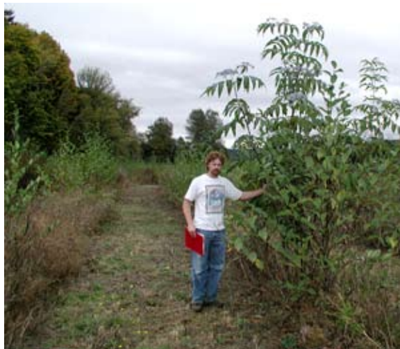
Figure 8.—Success in restoring sites has a lot to do with selecting “appropriate” plant materials; i.e., species that are suitable for the site, are grown from locally adapted sources, and have a solid genetic composition.

http://www.epa.gov/wed/pages/ecoregions/or_eco.htm