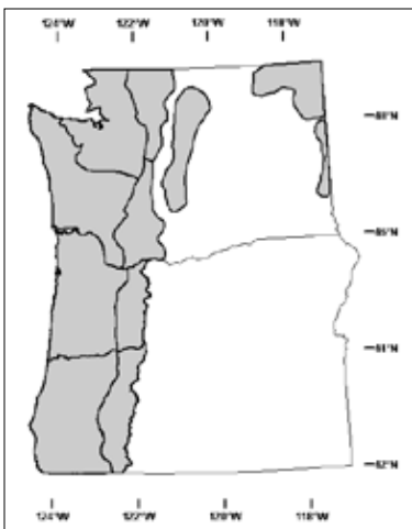
Figure 3.—Seed zone maps of Oregon and Washington for Douglas-fir (at top), which is a site specialist, and western redcedar, a site generalist.

more similar to Astoria than Roseburg) include rainfall, summer and winter temperatures, soil drainage, and soil pH.