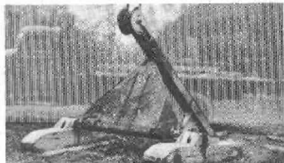
Figure 5.--Sulky with runners for snow