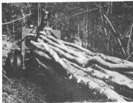
Figure 4.--Dual-tired sulky used to skid tree-length hardwood pulpwood by the Brown Company, N. H.