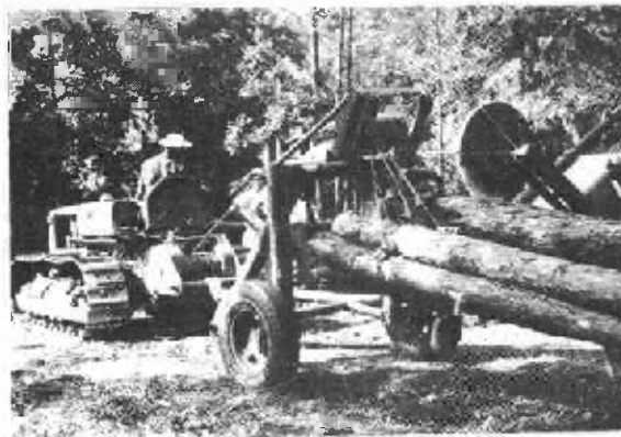
Figure 2.--Single-wheeled sulky skidding tree-length pine pulpwood