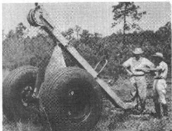
Figure 3.--Sulky equipped with balloon tires