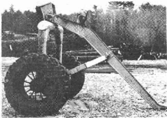
Figure 1.--Commercial sulky