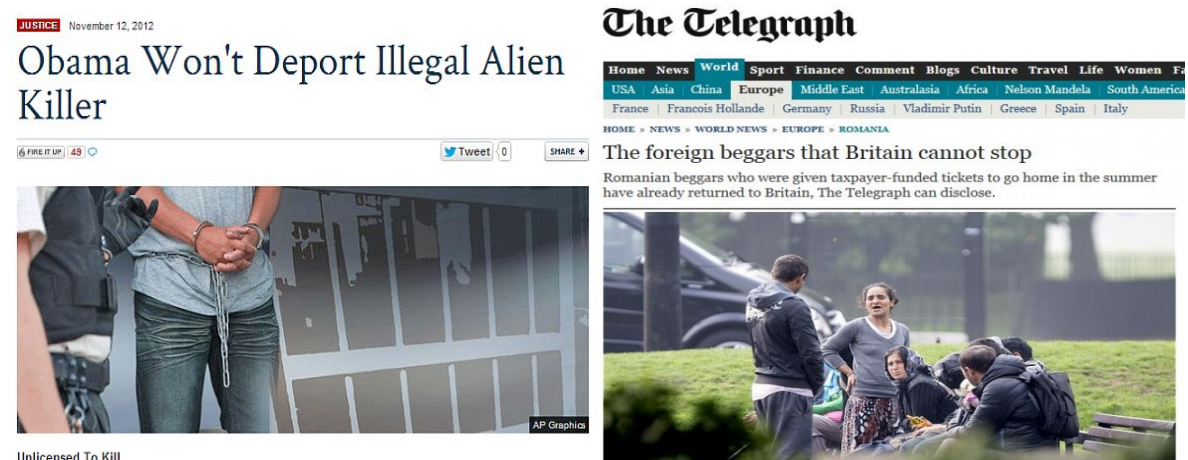
(Saunders, 2012; Duffin and Mendick, 2013) (Gye, 2013)

Social construction, therefore, relies on a reinforced message and stereotype of deviant groups for the allocation of burdens and benefits. The rewards and justifications for policies are found in the message that mirrors institutional and cultural norms. Social Construction is not static. While it is a long and challenging process to change the social construction of a group, it is possible for a deviant group to achieve favorable standing. U.S. Veterans suffering from Post-Traumatic Stress Disorder (PTSD), for example were once seen as stigmatized and marginalized with little resources to improve their mental health and lacked a diagnosis. As PTSD became a recognized medical diagnosis and efforts to destigmatize the diagnosis came into play, veterans were targeted to receive policies that treated PTSD (Thompson, 2008; Aryee, 2013). The same process of recognition for migrants could decrease their marginalization.