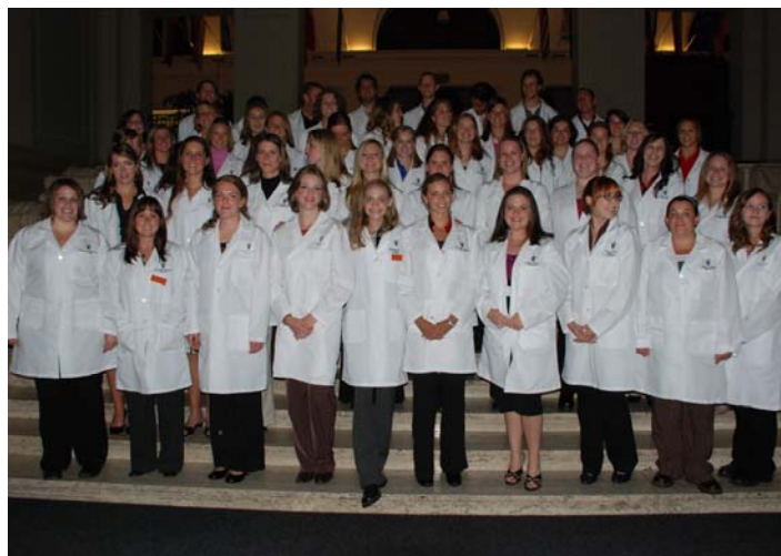
Class of 2012 in their white coats.

Special thanks go to the sponsors of the White Coat Ceremony and Dinner: Hill's Pet Nutrition, Inc. and the Student Chapter of the American Veterinary Medical Association for the dinner; and the Oregon Veterinary Medical Association for the lab coats and name badges.