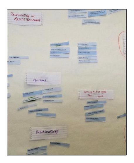
Figure 3.9 Photograph of mapping exercise used to generate categories.