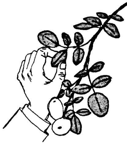
Figure 1.—On a walnut tree, take one midleaflet from a leaf in the middle of a fruiting terminal.

Sample leaves of apples, pears, sweet and sour cherries, peaches, prunes, filberts, walnuts, holly, blackberries, raspberries, blueberries, boysenberries, grapes, and cranberries.