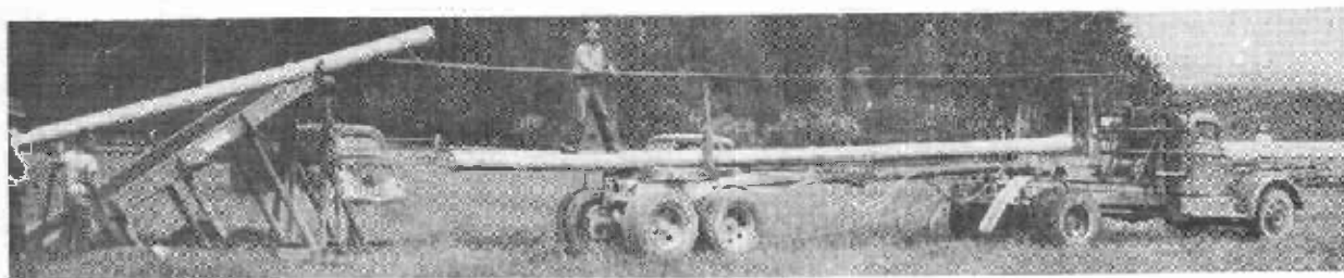
Figure 4.--Loading the first tier of logs