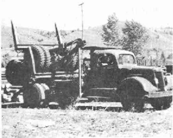
Figure 1.--Loading a trailer for return trip to the woods