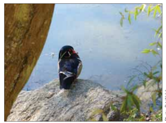
Wood ducks live in a variety of habitats associated with water.

Wood ducks live in a variety of habitats associated with water. They are found in wooded areas along lakes, rivers, creeks, and wetlands. They also use beaver ponds