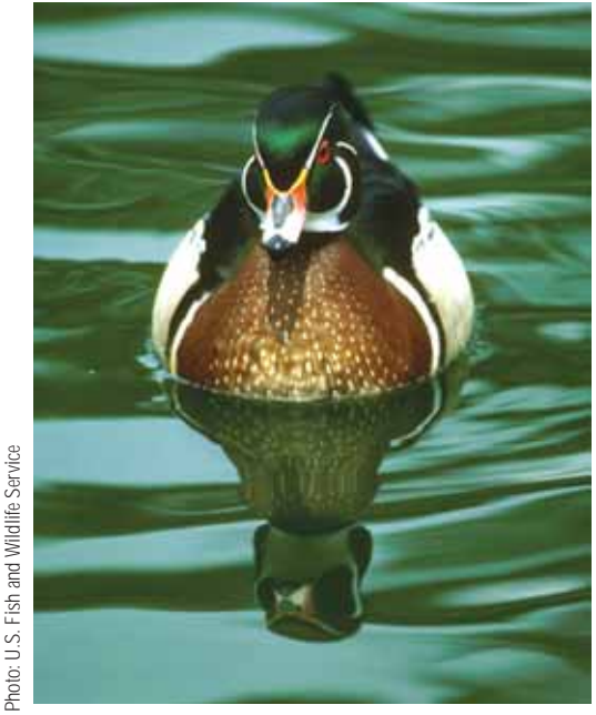
Bird watchers and other people who spend time outdoors love wood ducks' beauty.

In the 1910s, wildlife managers acted quickly to help save wood ducks. Laws were passed to protect migratory birds, hunting was controlled, and habitat was protected. Wood duck nest boxes were created in the 1930s. Slowly, wood duck