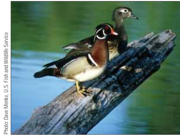
Wood ducks have some of the largest eyes of any duck.