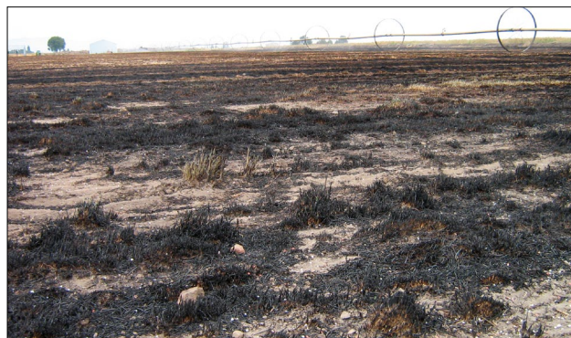
Figure 3.—Burning increases soil pH at the surface, thus increasing the likelihood of N volatilization from fertilizer on the soil surface.

For more information, see Montana State University Extension publication EB 173, Management of Urea Fertilizer to Minimize Volatilization .