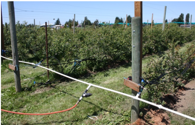
Fig. 1. Drip line irrigation connected through PVC manifold.

Neonicotinoid pesticides were tested as a systemic ovicide for SWD control. Chemigation trials were performed on blueberry bushes in the WSU NWREC experimental field. Neonicotinoids were shown to exhibit systemic entry into the blueberry leaf tissue, but no insecticides were found in the fruit tissue based on bioassays or laboratory residual tests.