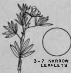
3-7 NARROW LEAFLETS