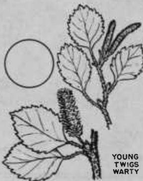
YOUNG TWIGS WARTY