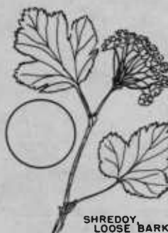
SHAGGY LOOSE BARK