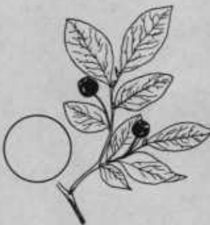
THIN LEAVES, RIBBED TWIGS