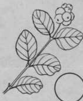
WHITE BERRIES HANG ON