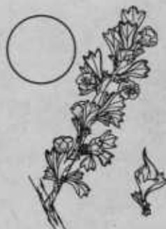
LEAF MARGINS ROLLED UNDER