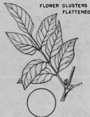
FLOWER CLUSTERS FLATTENED