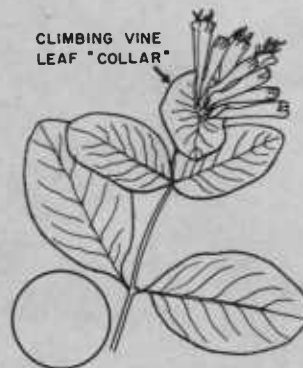
CLIMBING VINE LEAF "COLLAR"