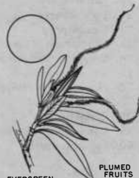
EVERGREEN, MARGINS CURL UNDER PLUMED FRUITS