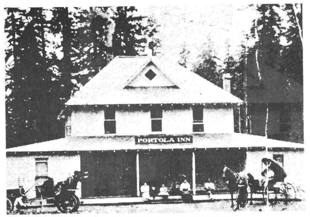
Portola Inn and Noti in 1910 or '11, courtesy Helen Burton.