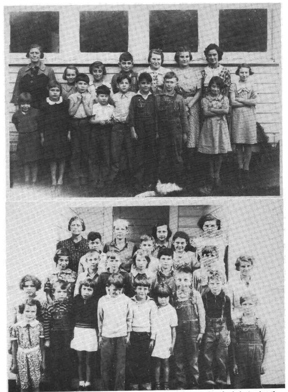
Can you identify the school, the teacher, the pupils? Please call or write your editor with any information you can supply. 28 Lane County Historian