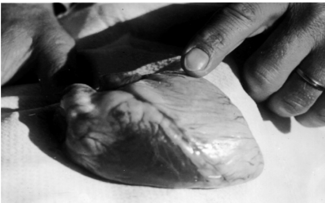
Figure 1.—Calf heart severely damaged by “white muscle disease.” Note the light color of the affected ventricle. This animal died spontaneously from heart failure.