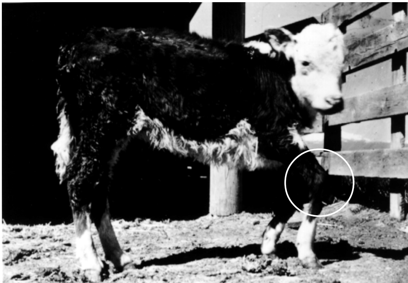
Figure 2.—Calf showing difficulty using forelegs, a characteristic of white muscle disease. This problem can be prevented or corrected by careful administration of selenium.

Cows or ewes receiving a selenium-deficient diet during gestation may give birth to offspring suffering from this trace-mineral deficiency. Their calves or lambs may be born dead or weak and die during the first few days of life. In cases of extreme deficiency, permanent damage may occur, and,