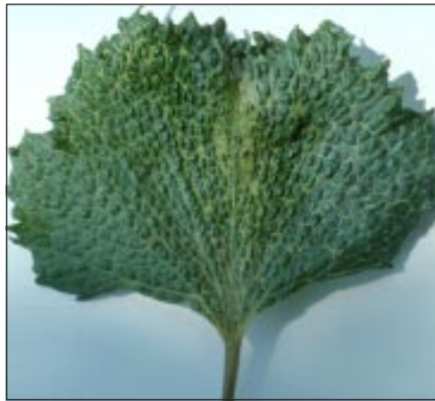
Figure 2.—Farther down the shoot, leaves have a fan-shape appearance. Leaves sometimes are cupped, and margins often end in sharp points.

These products come in containers ranging from 1-quart bottles of ready-to-use solution to 5-gallon drums of highly concentrated active ingredient. They do not require a pesticide license for purchase and are readily available from department stores, home improvement stores, co-ops, retail nurseries, farm chemical dealers, etc.