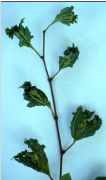
Figure 1.—New leaves and growing tips show the most severe damage. Affected leaves are small, narrow, and misshapen.

Phenoxy herbicides include 2,4-D, MCPA, Crossbow, Banvel, Garlon, Weed-B-Gone, and Brush Killer. They also are the active ingredient (2,4-dichlorophenoxyacetic acid, 2-methyl-4-chlorophenoxyacetic acid, triclopyr, or dicamba) in “weed and feed” and brush control products for use in the home landscape.