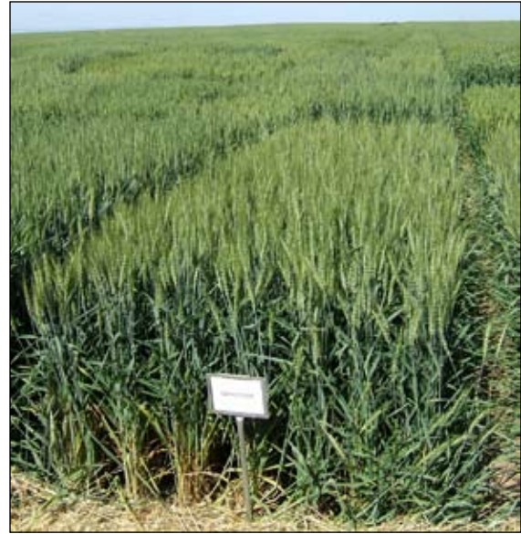
Figure 3. Goetze wheat in the field.

In trials over 24 site-years, Goetze was found to be approximately 2 inches shorter than Stephens, 5 inches shorter than Tubbs or Tubbs-06, and about 1 inch taller than Gene (Table 1). The height differentials are somewhat greater in the high-rainfall environment of western Oregon, where Goetze may be as much as 6–7 inches shorter than Tubbs or Tubbs-06 and 3–4 inches shorter than Stephens and Madsen. Goetze's straw strength is excellent, and lodging has not been observed in any production environment.