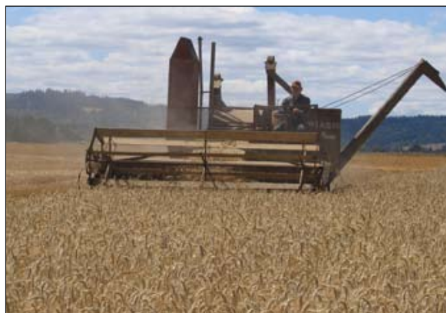
Figure 1. Vince Dobbin harvesting a Goetze wheat test plot at Dobbin Farms near Hillsboro, Oregon. The combine in the photograph was previously owned by Norm Goetze, retired OSU Extension specialist, for whom Goetze wheat is named.

Goetze was released in 2007 and is protected under U.S. Plant Variety Protection without the Title 5 option.