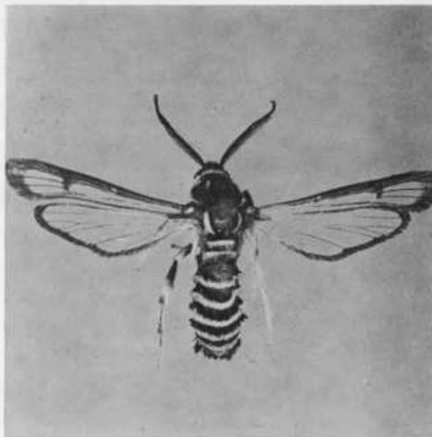
Borer moths emerge from pupae in August and September. Moth is about 5/8 inch long.

Adults emerge during August and September from pupae in the base of old canes. Eggs are laid singly on the under side of leaves, near the