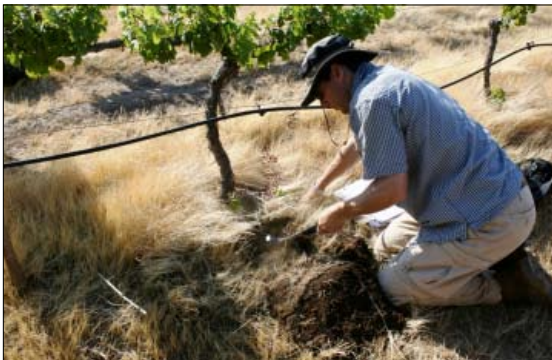
Figure 5. In late summer, collect soil samples to detect phylloxera infestation. Collect samples to a depth of 4 feet from a 1.5-foot radius around the base of vines. Stunted shoots are evidence of infestation.

Grape phylloxera feeding weakens the grapes' root systems, resulting in low-vigor canopy growth and an overall weakened appearance over several seasons. Other factors can cause similar symptoms (see Chapter 1, page 5). Root sampling and monitoring for the pest can confirm whether phylloxera is causing the problem.