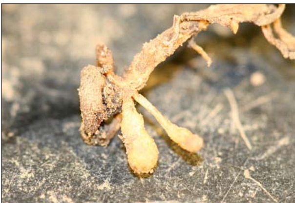
Figure 3. Root galls (nodosities) form at the end of young roots due to phylloxera feeding.

It may take 2 to 5 years from the time of initial infestation for symptoms to appear, depending on vine vigor, method of infestation, and location of the planting. In warm areas such as California, phylloxera can have four or five generations per season, and vineyards may decline quickly (in as few as 3 to 5 years). Oregon likely has only two or three generations of phylloxera per season, which