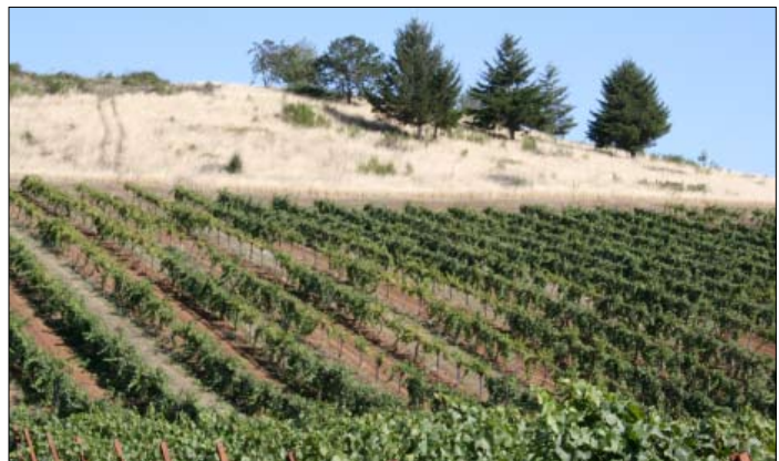
Figure 4. Phylloxera infestation spreading through an Oregon vineyard. Notice the oval pattern of affected vines.