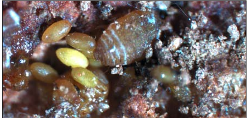
Figure 2. Phylloxera female (center) and eggs found on vine roots of an Oregon vineyard.

In addition to the radicle life cycle described above, phylloxera can live out another stage of its life cycle on leaves. This form is the gallicole and is generally observed on American Vitis species (not on Vitis vinifera ). Gallicoles hatch in