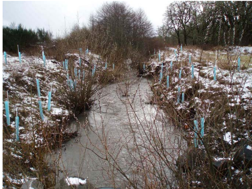
Figure 1. Newly installed planting along Newton creek, Benton County, Oregon.