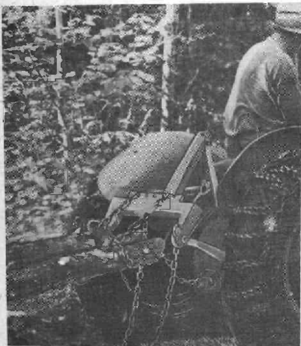
Figure 2.--Skidding attachment raised to skidding position.