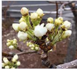
Pear blossoms beginning to open.

Madras Garden Depot (Madras) and Landsystems Nursery (Bend). Make sure you are buying both the trap and the lure as sometimes they are sold separately. One trap and lure provides monitoring for ten trees. They cost anywhere from $13-20 for one to two traps. If you need larger quantities you can get them online at Gemplers, http://www.gemplers.com/search/codling+moth+trap .