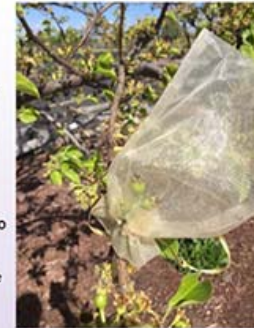
Fruit bagging on Asian Pear.

Now is the time to purchase your management tools. If you do not want to use chemical control you should consider bagging your fruit. You can use these mini organza drawstring bags (purchased at Michaels or Hobby Lobby) and place them around the fruit when pea sized (1/2 to 3/4")—make sure they are big enough for mature size fruit. Brown paper bags can also be used. Ideally these will minimize or reduce the moth from laying its eggs on the fruit and the larvae getting into the fruit. We have used these in the past and had moderate success even with a late start of putting them on the fruit.