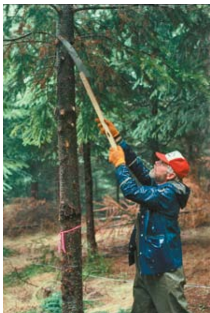
Figure 2. Pruning Douglas-fir with a pole saw.