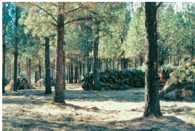
Figure 3. Pruned stand, in which branches are piled and ready for burning.

where other forms of fuels reduction might be too dangerous or otherwise impractical.