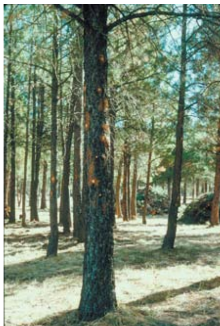
Figure 1. Pruned ponderosa pine.