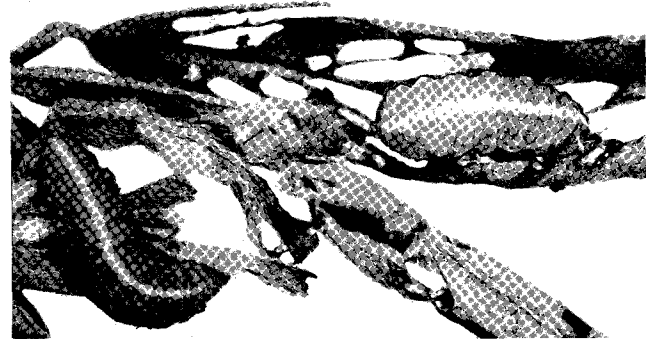
Alfalfa weevil larvae and typical leaf injury. The larvae are green with a white stripe down the back. Fully grown larvae are about 3/8 of an inch in length.

Starting in late May, small, newly hatched larvae may be found by sweeping the field with an insect net. Treatment usually should not be applied this early in the season because delayed egg hatching during periods of cool or inclement weather may produce larvae after the insecticide has lost its effectiveness.