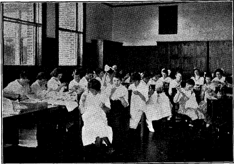
Club winning girls in the College sewing laboratory

7. Dairy Herd Record-Keeping Project. Obtaining the milk, butterfat, and feed records of at least two cows for a period of six months and the scoring of four dairy cows and two dairy barns.