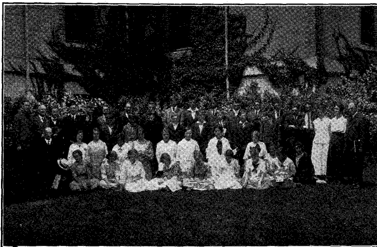
Industrial Club members and their leaders, at O. A. C. Summer School, 1916

Extension Bulletin 219 Corvallis, Oregon October, 1917