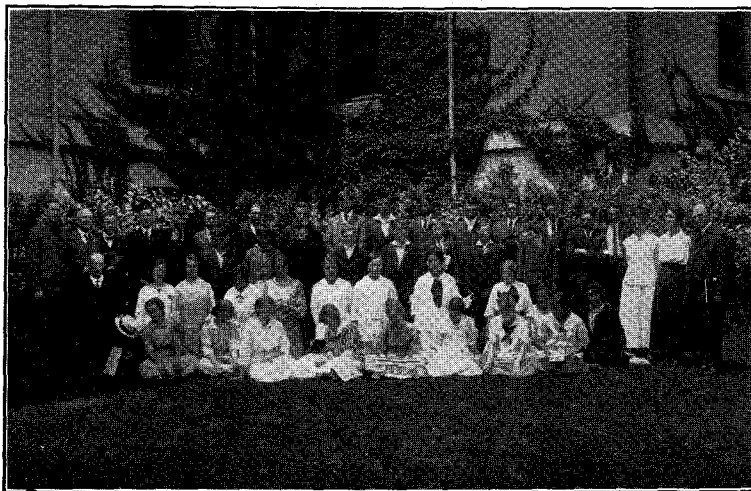
Industrial Club members and their leaders, at O. A. C. Summer School, 1916

Extension Bulletin 219 Corvallis, Oregon October, 1917