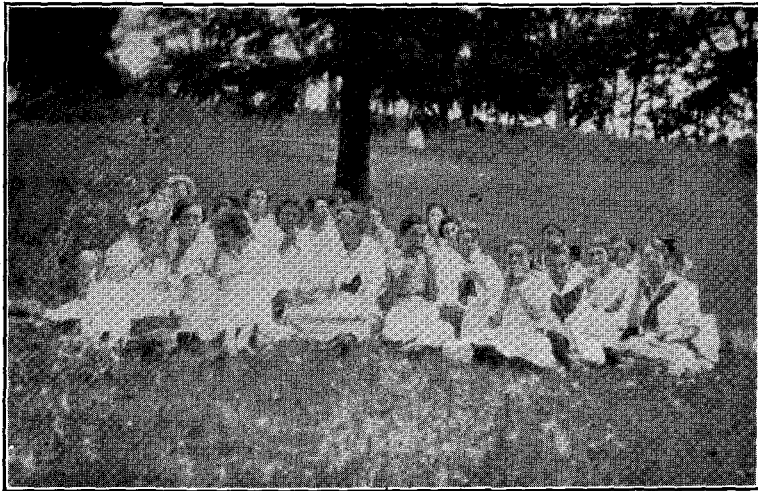
Club girls picnicing while at the College

12. Farm and Home Handicrafts Project. The completion of three or more articles from a list of 20.