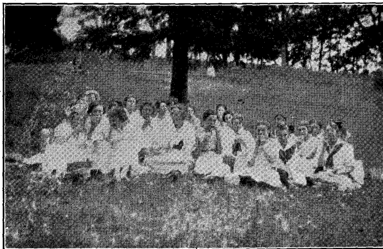
Club girls picnicing while at the College

12. Farm and Home Handicrafts Project. The completion of three or more articles from a list of 20.