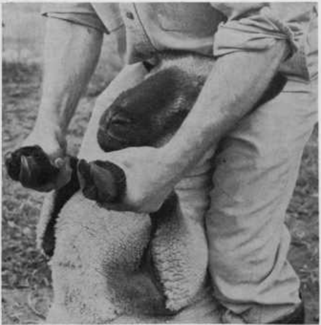
Shearing time is ideal time to trim feet.