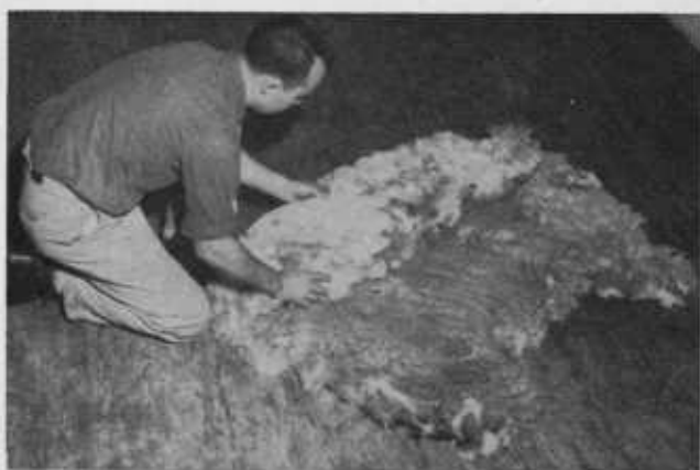
Rolling side of fleece.