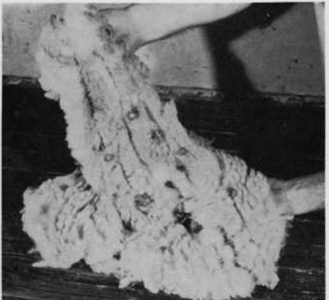
Weeds containing burs should be cut from pastures. Burry, seedy, or chaffy wool sells at a discount.