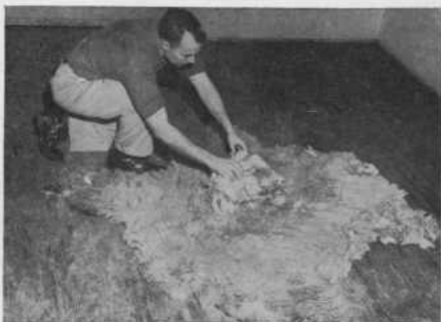
Place belly wool in middle of fleece.