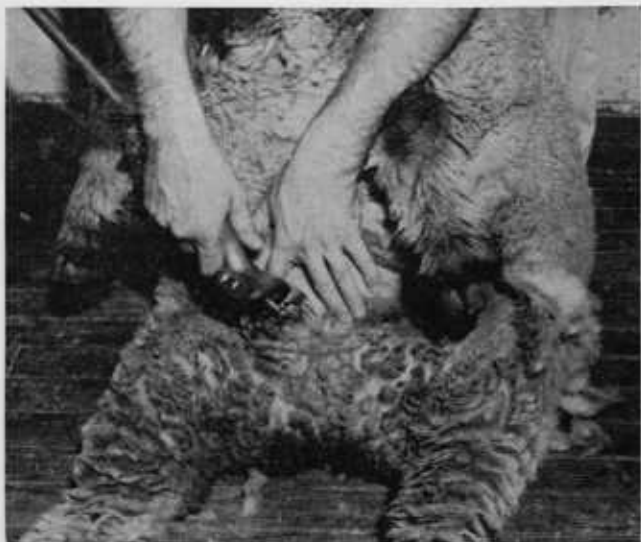
Crutching-out ewe before lambing is a good management practice. Be careful when shearing around teats.