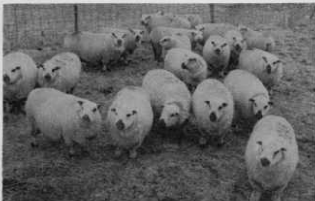
Shearing heads in fall is excellent practice for preventing wool blindness. Midwinter view of sheep whose heads were shorn the previous fall.

By observing these precautions, sheepmen will have fewer rejects when they market their wool clip.