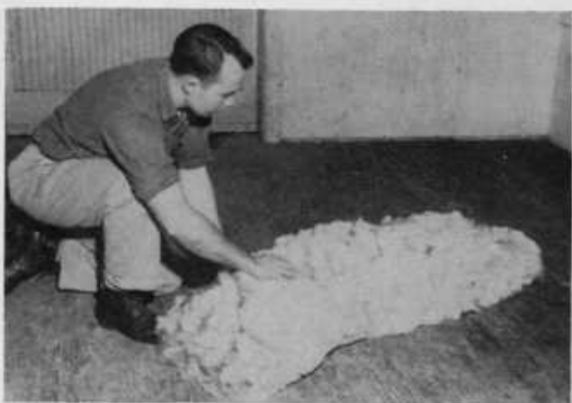
Both sides rolled in.