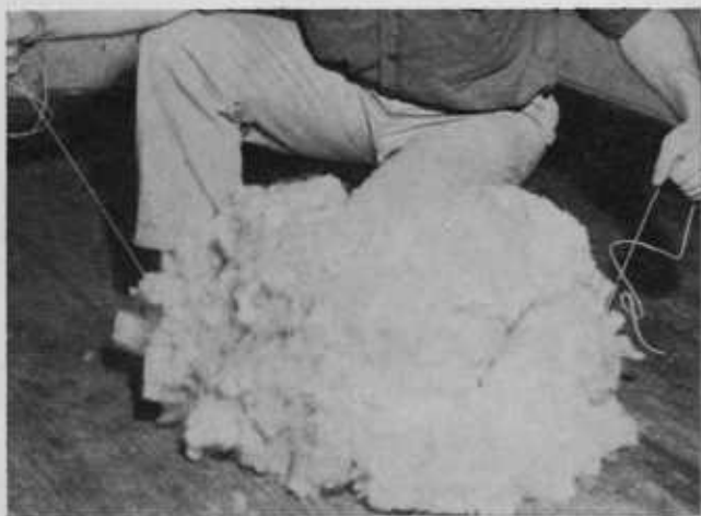
Tie fleece with paper twine.