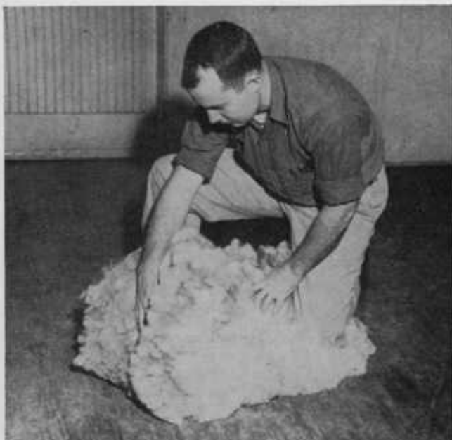
Ends rolled in to make a neat bundle.