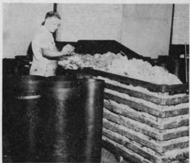
Properly tied fleeces are convenient for efficient work of wool sorter.