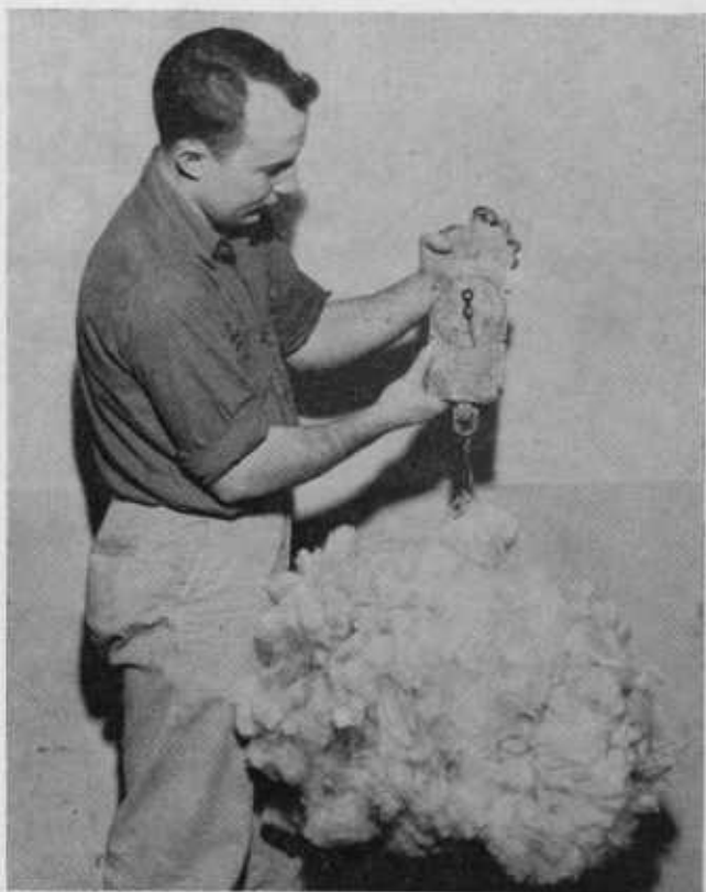
The fleece weight of every sheep is recorded by many breeders to aid them in flock improvement program.