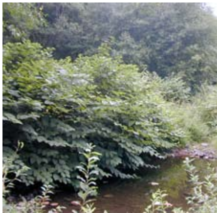
Figures 1a–b.—Giant knotweed thrives in moist, open areas.