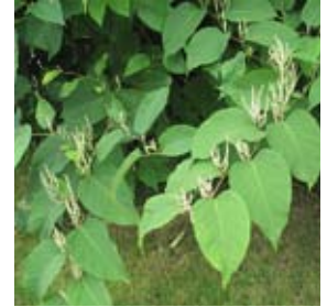
Figure 2.—Giant Japanese knotweed leaves and flowers.

Stems (canes) of knotweed are upright, hollow, jointed, and unbranched. Leaves are broad, oval to heart-shape, and 2 to 11 inches long by 2 to 9 inches wide (Figure 2). Greenish white flowers, each 0.08 to 0.12 inch wide and arranged in dense clusters (panicles), originate where leaves join stems. Knotweed is most commonly spread by floodwater, animals, and human activity (e.g., cut-and-fill waste) that disperses rhizome or shoot fragments, which form new plants.